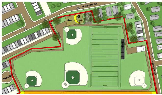
SITE PLAN DETAIL OF ATHLETIC FIELDS